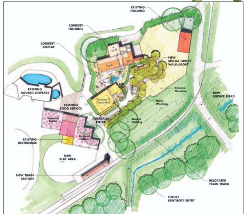
Architect's drawing of Lorikeet Landing.